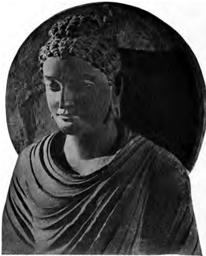
A GANDHARA BUDDHA AT HOTI-MARDAN